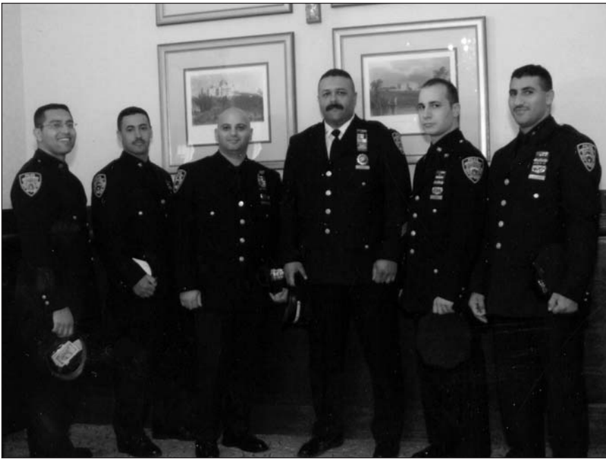
Arab American members of the New York City Police Department who took part in the rescue effort were honored at the Arab American Institute Foundation's 2002 Kahlil Gibran "Spirit of Humanity" Awards gala.