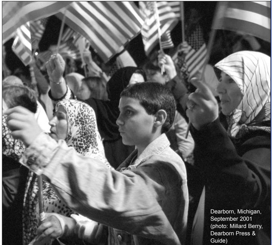
Dearborn, Michigan, September 2001

"Because men with hard faces do violent things, because fanaticism seizes and shrinks minds, is no reason for the rest of us to abandon our songs. Maybe we need to sing louder."