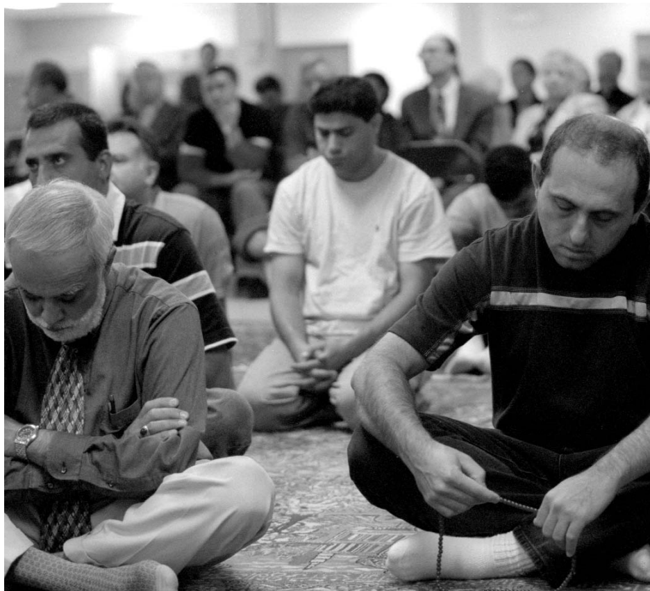
Members of the Islamic House of Wisdom in Michigan held a special prayer for the victims of the Sept. 11 attacks. They invited members of local Christian churches, shown here seated in the background, to attend.

They decided to produce a television spot conveying the message of “Tolerance” and working with AAI and Brokaw, a version of the “Twin